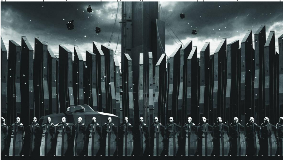
For the Combine, Citadels

Citadels are designed as much for psychological impact as military might. Their sheer scale, featureless surfaces , and partial visibility on the skyline are intended to project inevitability. Unstoppable, eternal presence;